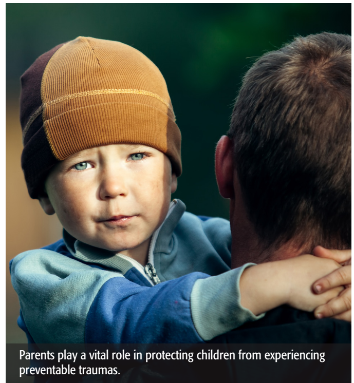
Parents play a vital role in protecting children from experiencing preventable traumas.

The second study involved interviews with nearly 6,500 American youth aged 13 to 17 years. 3 Also based on DSM definitions, 61.8% reported being exposed to at least one potentially traumatic event during their lifetime. Experiencing the unexpected death of a loved one was the most frequent trauma (28.2%), followed