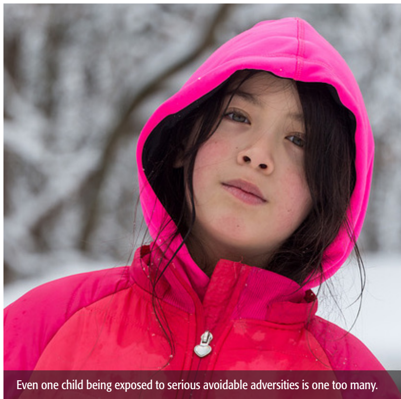
Even one child being exposed to serious avoidable adversities is one too many.

Both evaluations of Fostering Healthy Futures included American children aged nine to 11 living in foster care due to maltreatment. 13-14 The program aimed to improve children's mental health and quality of life. Children participated in 30 group sessions that taught skills such as recognizing emotions, solving problems