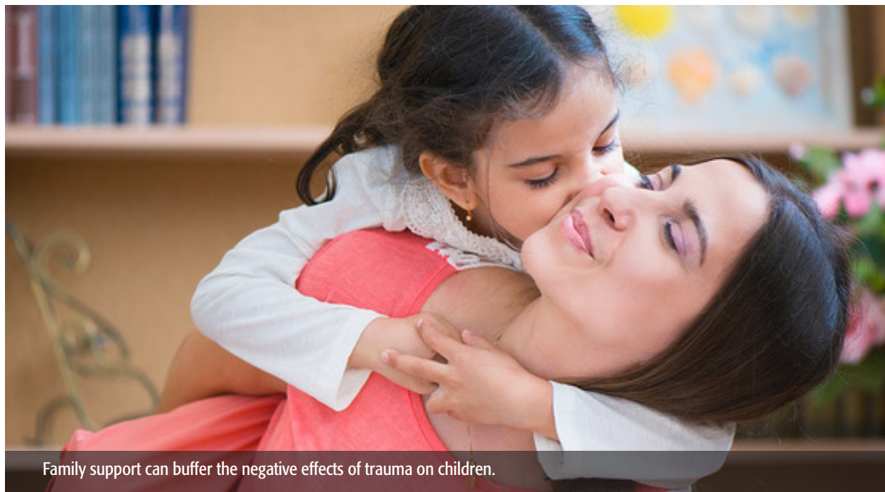
Family support can buffer the negative effects of trauma on children.

Even after children have experienced a serious adversity such as maltreatment, it is possible to prevent mental health symptoms from developing.