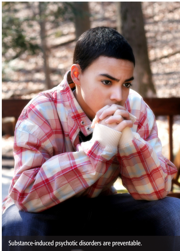
Substance-induced psychotic disorders are preventable.

Psychotic disorders typically involve delusions and hallucinations, among other symptoms. 1 Delusions are strongly held false beliefs that persist despite evidence to the contrary and that cannot be explained by the individual's cultural or religious background. Hallucinations are sensations, such as hearing voices, in the absence of external causes. Psychosis may also include disorganized thinking, atypical motor behaviour and “negative” symptoms, such as loss of motivation and lack of social engagement. As with many mental disorders, potentially reversible causes such as infection or intoxication must be ruled out when diagnosing psychosis. Schizophrenia, schizoaffective disorder and delusional disorder are among the psychotic disorders recognized in the Diagnostic and Statistical Manual of Mental Disorders . 1