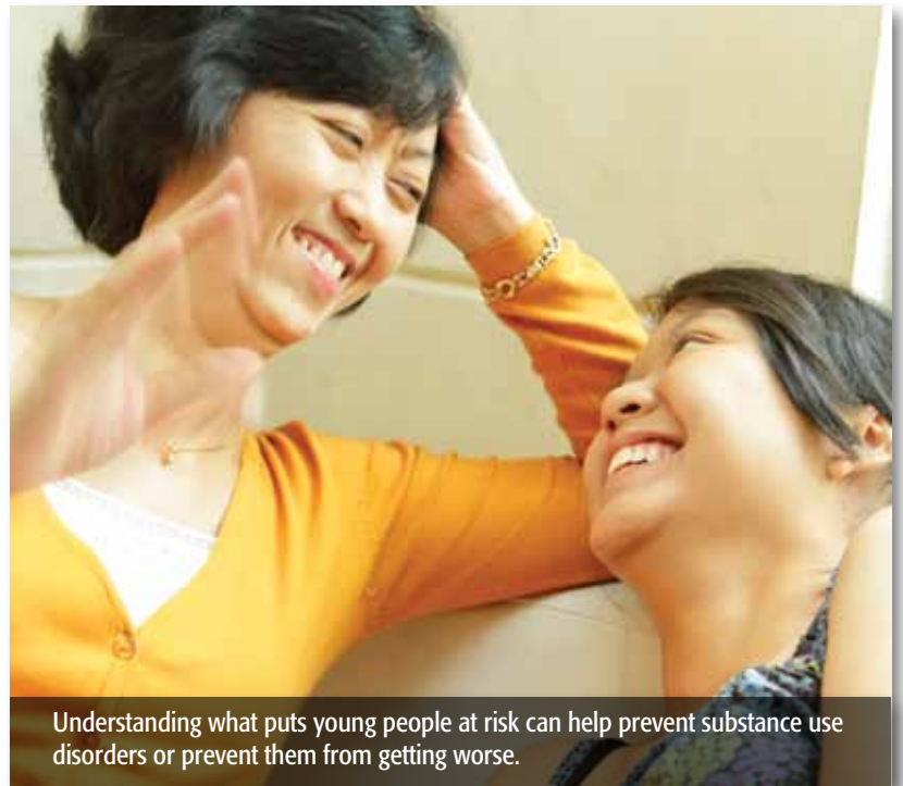
Understanding what puts young people at risk can help prevent substance use disorders or prevent them from getting worse.

Young people commonly experiment with substances such as alcohol and cannabis. 1 Still, for the vast majority, experimentation does not lead to problematic use. In fact, at any given time, only an estimated 2.4% of Canadian youth use alcohol or drugs at a level that qualifies for a substance use disorder diagnosis — with alcohol and cannabis problems being the most common. 2 Table 1 describes the diagnostic criteria used to identify substance use disorders in young people. 3