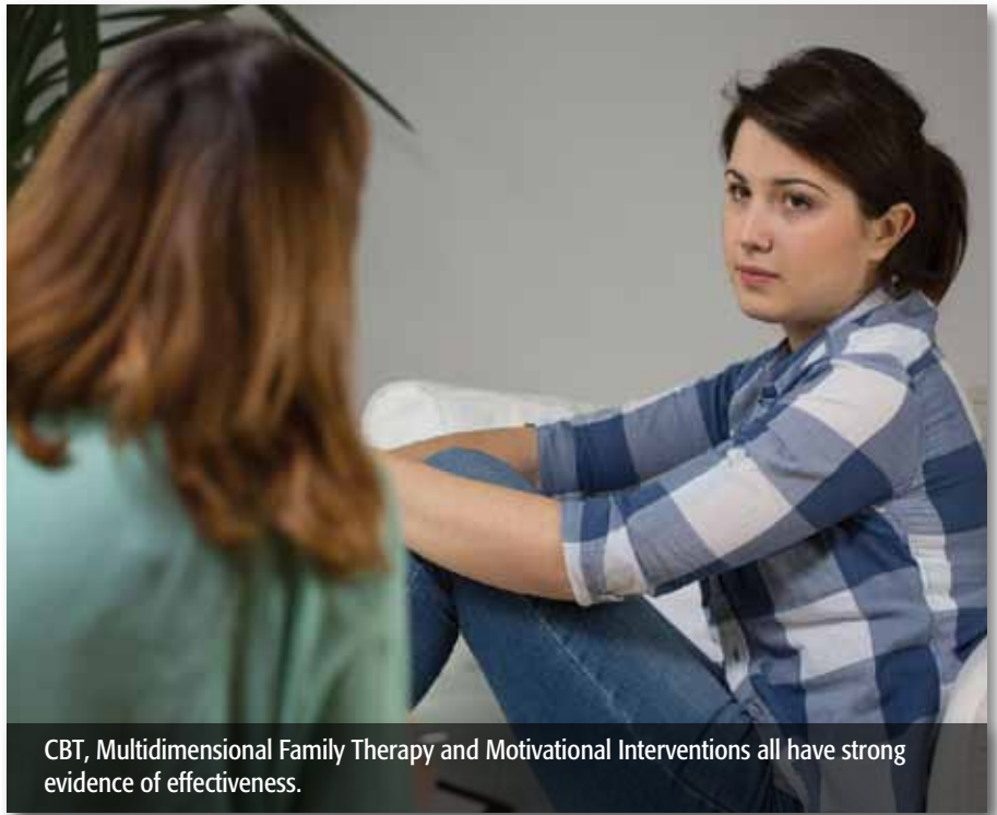
CBT, Multidimensional Family Therapy and Motivational Interventions all have strong evidence of effectiveness.

There are many effective community-based treatments for substance use disorders, so practitioners should choose one that most suits the young person.