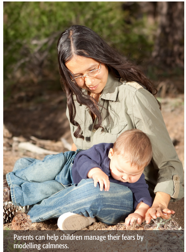
Parents can help children manage their fears by modelling calmness.

During the COVID-19 outbreak, some children who need mental health treatment may no longer have in-person access to their practitioner. To address this, many practitioners are doing their best to provide services by telephone or video conferencing. To help support more children who may be in need of treatment during times of social distancing, we feature five successful interventions in the Review article, including treatments for anxiety, attention-deficit/hyperactivity disorder and depression — all of which can be self-delivered. 🖐️