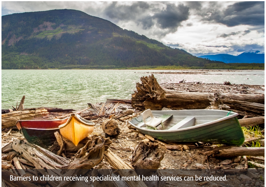
Barriers to children receiving specialized mental health services can be reduced.

But how effective are these self-delivered forms of treatment, and are they suitable for common childhood mental disorders? In the Review that follows, we highlight recent studies on five such treatments that have considerable potential to reach more children in need. 🙌