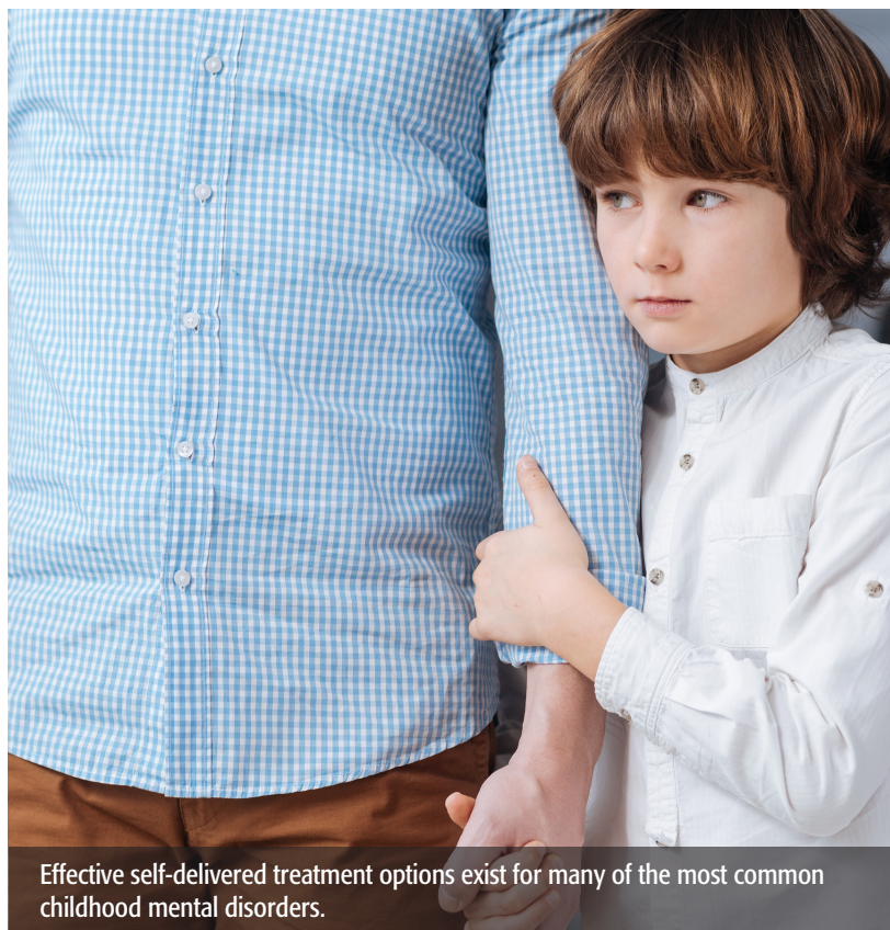
Effective self-delivered treatment options exist for many of the most common childhood mental disorders.

The three RCTs of anxiety treatments were similar in several ways. Children had to meet diagnostic criteria for a primary anxiety disorder according to Diagnostic and Statistical Manual of Mental Disorders IV standards. 21 All three treatments used cognitive-behavioural therapy (CBT), including providing education about anxiety, challenging unhelpful thinking, and practising facing feared situations. 11, 14-15 As well, all three included components for both children and parents.